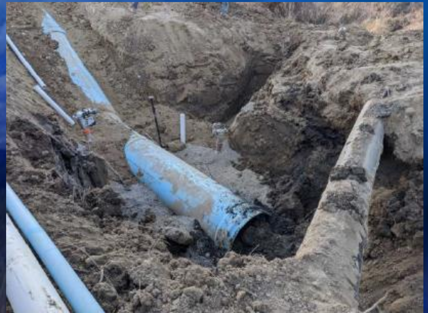
Crossing another pipeline