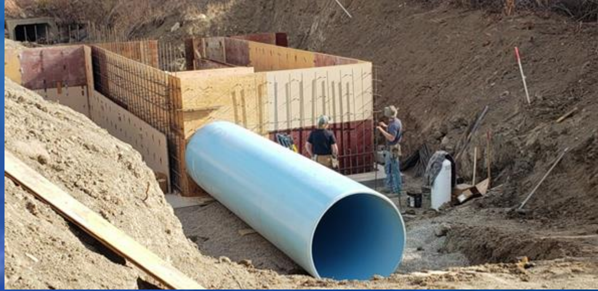
Completed Trash Rack